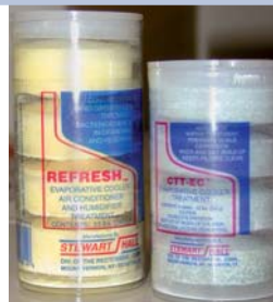
Scale & Algae Tablets