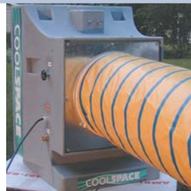
Flexible Ducts Kits