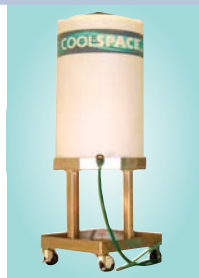
70 Gallon Water Tank