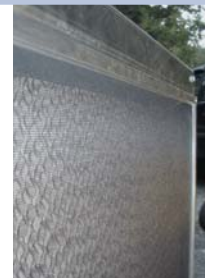
Pad Filters & Lint Guards