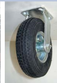
Pneumatic 8" Tires